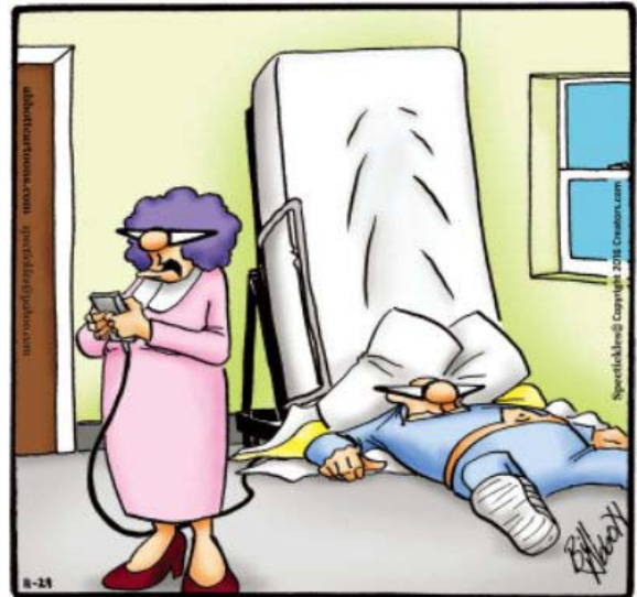
"How do you know this isn't the button for the nurses' station?"