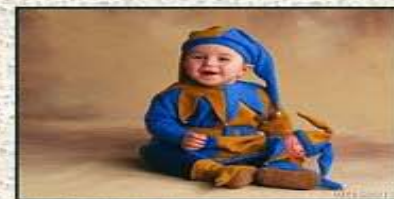
6. To Laugh