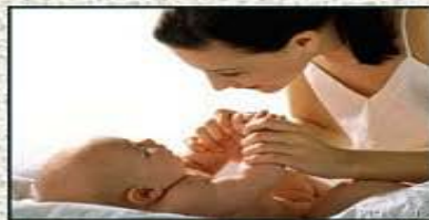
5. To Feel