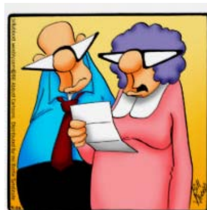
"It's from the hospital where you were born. You're being recalled for manufacturing defects."

God may have created man before woman, but there is always a rough draft before the masterpiece.