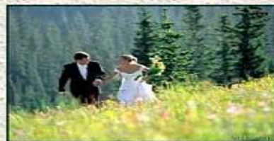
7. To Love

The room was so quiet you could have heard a pin drop. The things we overlook as simple and ordinary and that we take for granted are truly wondrous! A gentle reminder – that the most precious things in life cannot be built by hand or bought by man.