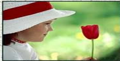
1. To See

The girl hesitated, then read, "I think the 'Seven Wonders of the World' are: