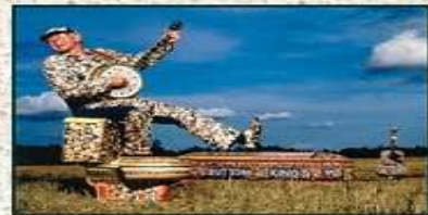
2. To Hear