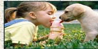
4. To Taste