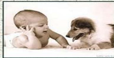
3. To Touch